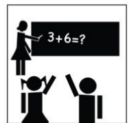
Full Stomachs = Attentive Learners

The Sheridan Story is committed to implementing a weekend food program so that no child goes hungry. We currently implement our Weekend Food Program in 200 schools throughout Minnesota, servicing 6,200 kids every week.